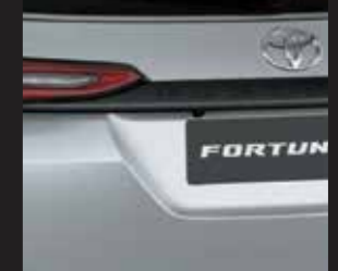
Back Monitor Supports smooth reversing operations when parking at a 90-degree angle or parallel parking, showing the rear view taken by a camera integrated into the rear of the vehicle on the display.*