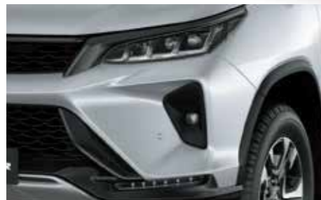
LED Headlamps and Fog Lamps