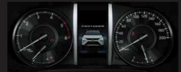
Combination Meters The easy-to-read meters and a 4.2-inch color TFT (Thin Film Transistor) multi-information display provide the driver with vital vehicle information at a glance. An Eco Driving Indicator supports eco driving.