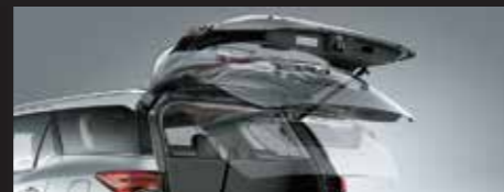
Power Back Door To make it even easier to load and unload, the powered back door can be opened and closed without the driver needing to leave their seat or be controlled from the rear of the car.