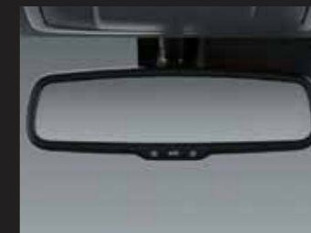
EC (Electrochromic) Inner Mirror Electrochromic Inner Mirror automatically senses light from behind during night time driving, and helps reduce glare by dimming its mirror surface.