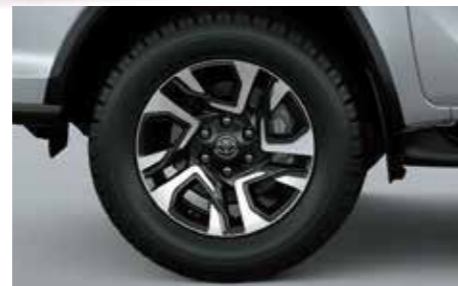
18-inch Alloy Wheel