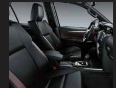
Power Seats for Driver & Front Passenger