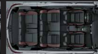
Seating Arrangement The spacious 7-seater SUV provides convenient seat configuration flexibility that satisfies the needs of a diverse range of lifestyles.