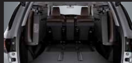
Luggage Space Storage The third row seats easily fold up with a single pull to provide both flexible and maximum luggage space.