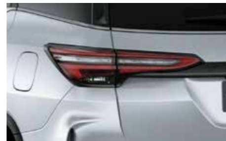
LED Rear Combination Lamp