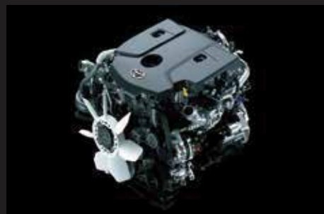
1GD-FTV Engine 2.8-liter VN Turbo Diesel with Inter Cooler 150kW/3400rpm 500Nm/1600-2800rpm

Beneath the sophistication, the robust frame and advanced off-road driving technologies form the core of the outstanding rough terrain capabilities.