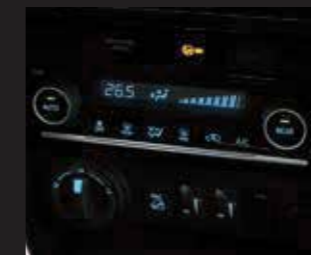
Automatic Air Conditioner The highly efficient system maintains a comfortable cabin temperature, and at the same time contributes to the excellent fuel economy.