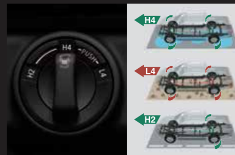
Part-time Transfer Switch Highlighting driver-friendly operation, you can switch between 2WD and 4WD by simply turning the dial switch, even while moving.