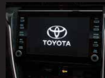
8-inch Display Audio An audio system that meets the progressive demands of the multimedia age, such as enhanced connectivity with external devices, is equipped.